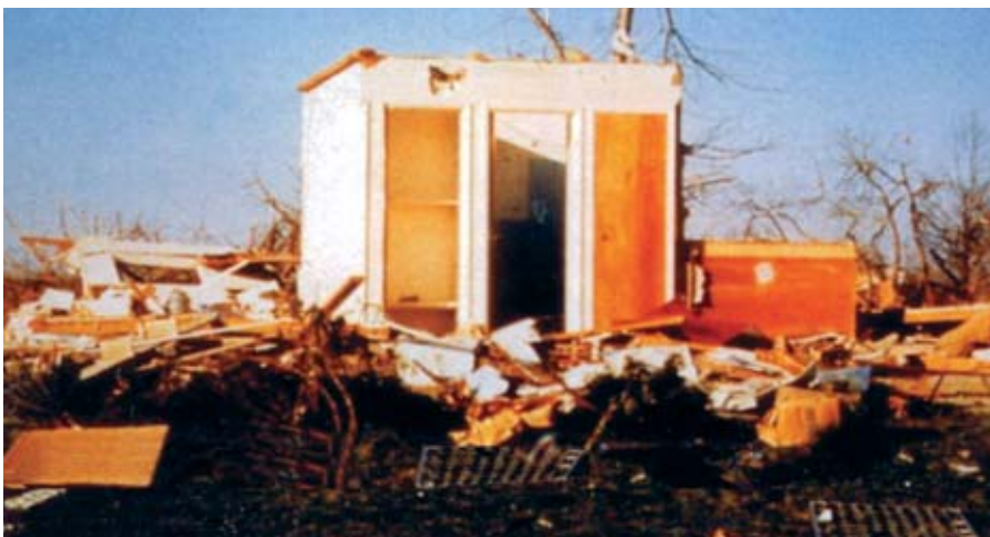
This interior room remains standing after a storm.

is also the most prone for hurricanes and tornados. In fact, according to the Federal Emergency Management Agency (FEMA), the eastern two thirds of the United States has the greatest concentration of tornados on earth. Whether or not you believe in global warming, there seems to be an escalating number of intense wind-borne storms.