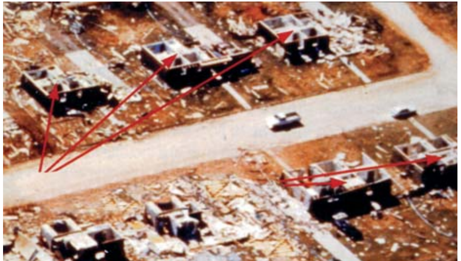
Red arrows indicate surviving interior rooms.

Many veterans and baby boomers continue to move to the Sun Belt, especially upon retirement. This area is also popular with people who have mobility impairments due to the ease of getting around during the winter months. At odds with this is the fact that this region